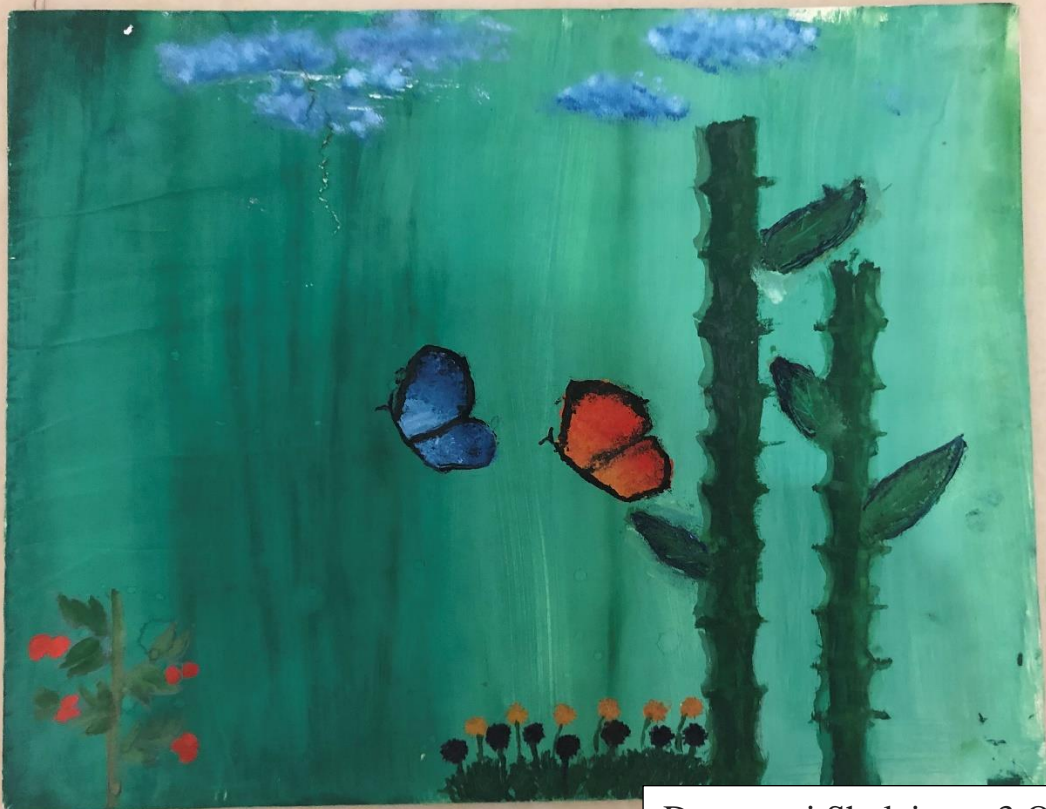
Devamayi Shylajan - 3 Q