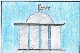
Obey Govt. Rules